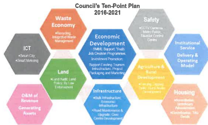
Figure 1: Council's Ten-Point Plan